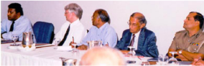
The headtable participants at the seminar.